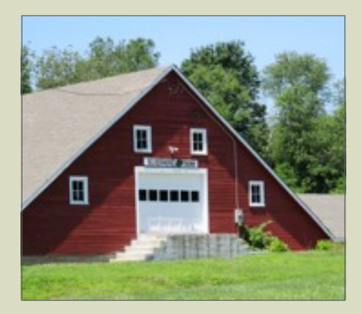
Silverherz Barn on protected farmland in Ellington